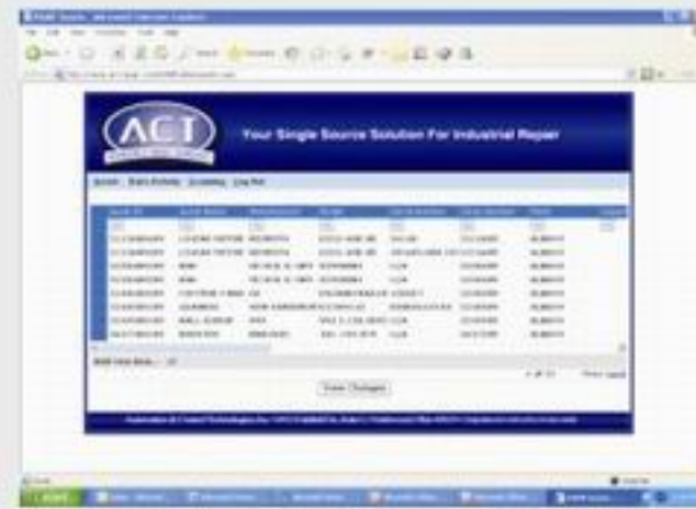
资产管理界面 Asset Administration Page