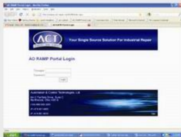
可维修资产管理系统 Repairable ASSET Management Program - R.A.M.P.