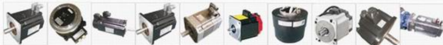
S&M伺服电机 NSK伺服电机 OKUMA伺服电机 S&M伺服电机 西门子伺服电机 FANUC伺服电机 横河伺服电机 松下伺服电机 安川伺服电机 欧姆龙伺服电机