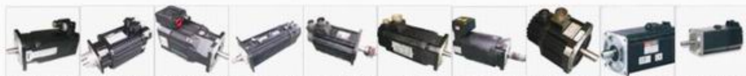
BAUTZ伺服电机 ESR伺服电机 ABB伺服电机 LENGE伺服电机 三星伺服电机 ELAU伺服电机 MOOG伺服电机 东芝伺服电机 三洋伺服电机 三菱伺服电机